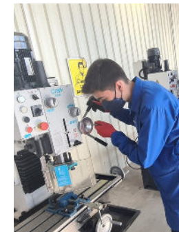
Basic Mechanic Workshop