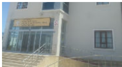
School Pension Building