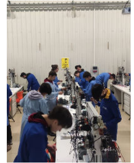
Sequential Control Workshop (PLC)