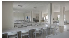
Pension Dining Room