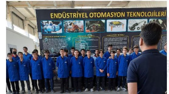
Basic Industry Applications Workshop